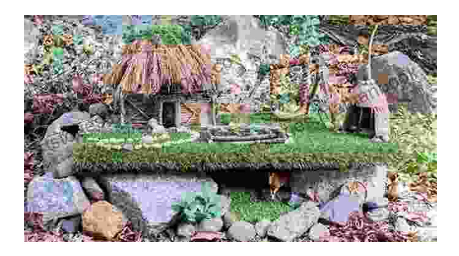
Fairy House Accessories to Complete the Enchantment

For those with a creative spirit, DIY fairy house projects offer an enjoyable way to bring your magical vision to life. Use your imagination and readily available materials to create charming fairy houses from scratch. Whether you prefer wood, clay, or paper crafts, there are countless tutorials and resources to guide you in this enchanting endeavor.