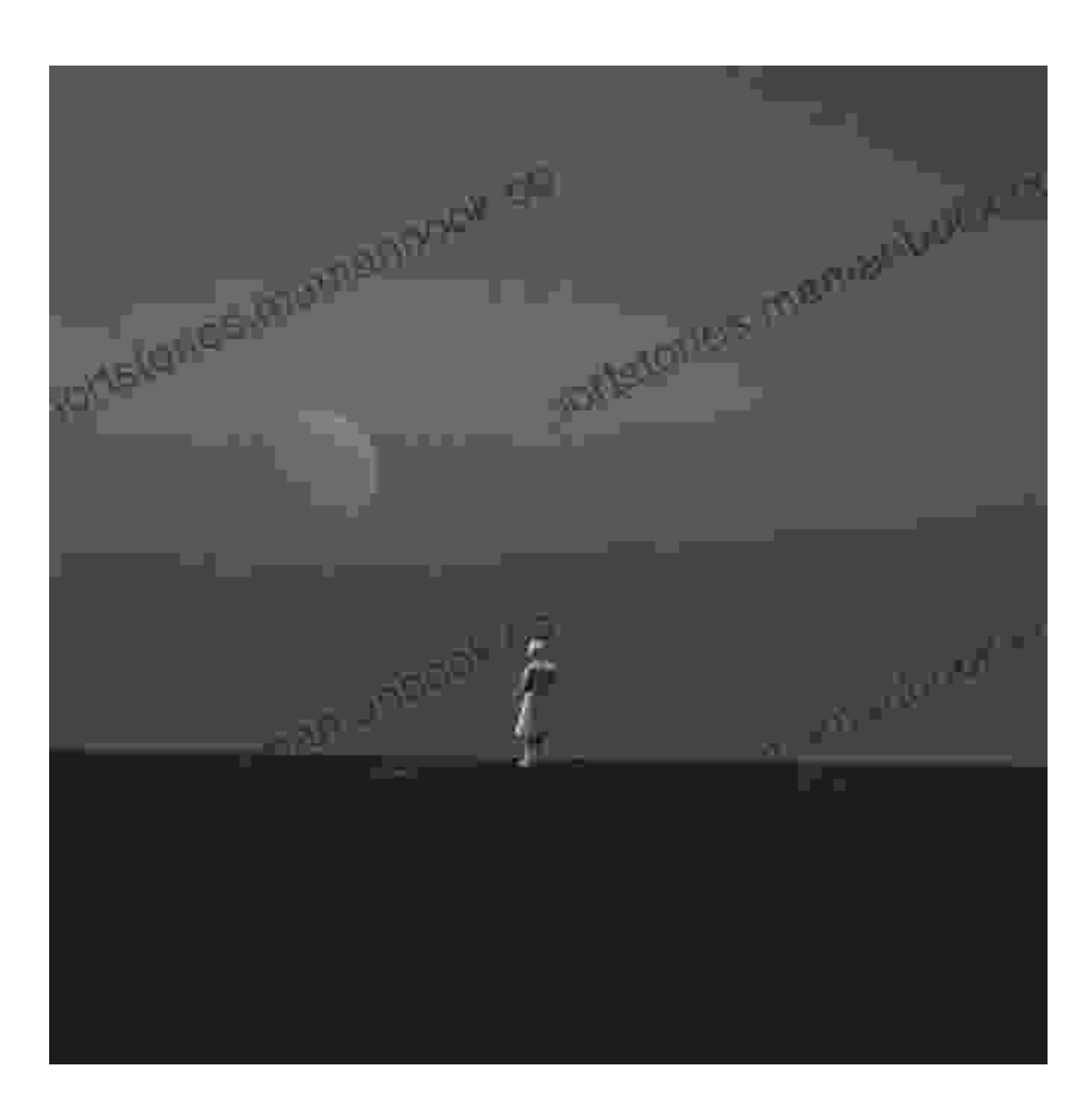
The Ethereal and the Sublime

passage of seconds and minutes has been frozen in a single, timeless frame. The result is a series of images that evoke a sense of both nostalgia and longing, reminding us of the fleeting nature of our own lives. Yet, amidst this exploration of temporality, Kolbusz also weaves a thread of memory, suggesting that the past is never truly lost, but rather exists as a potent force that shapes our present and future.