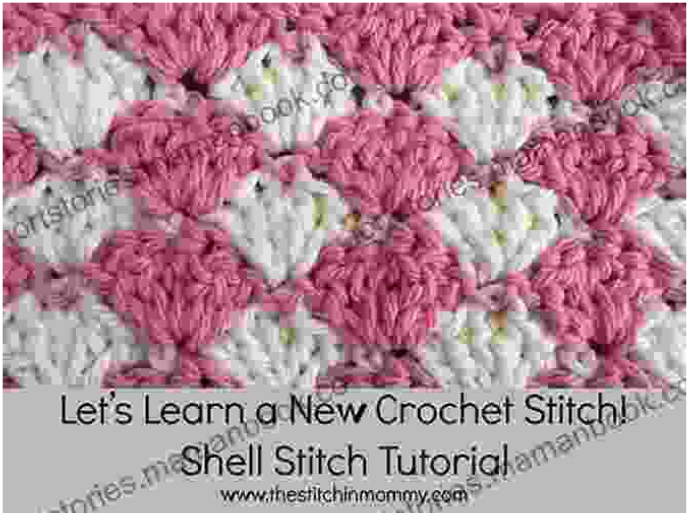
Close-up of the Susan Easy Shell Stitch