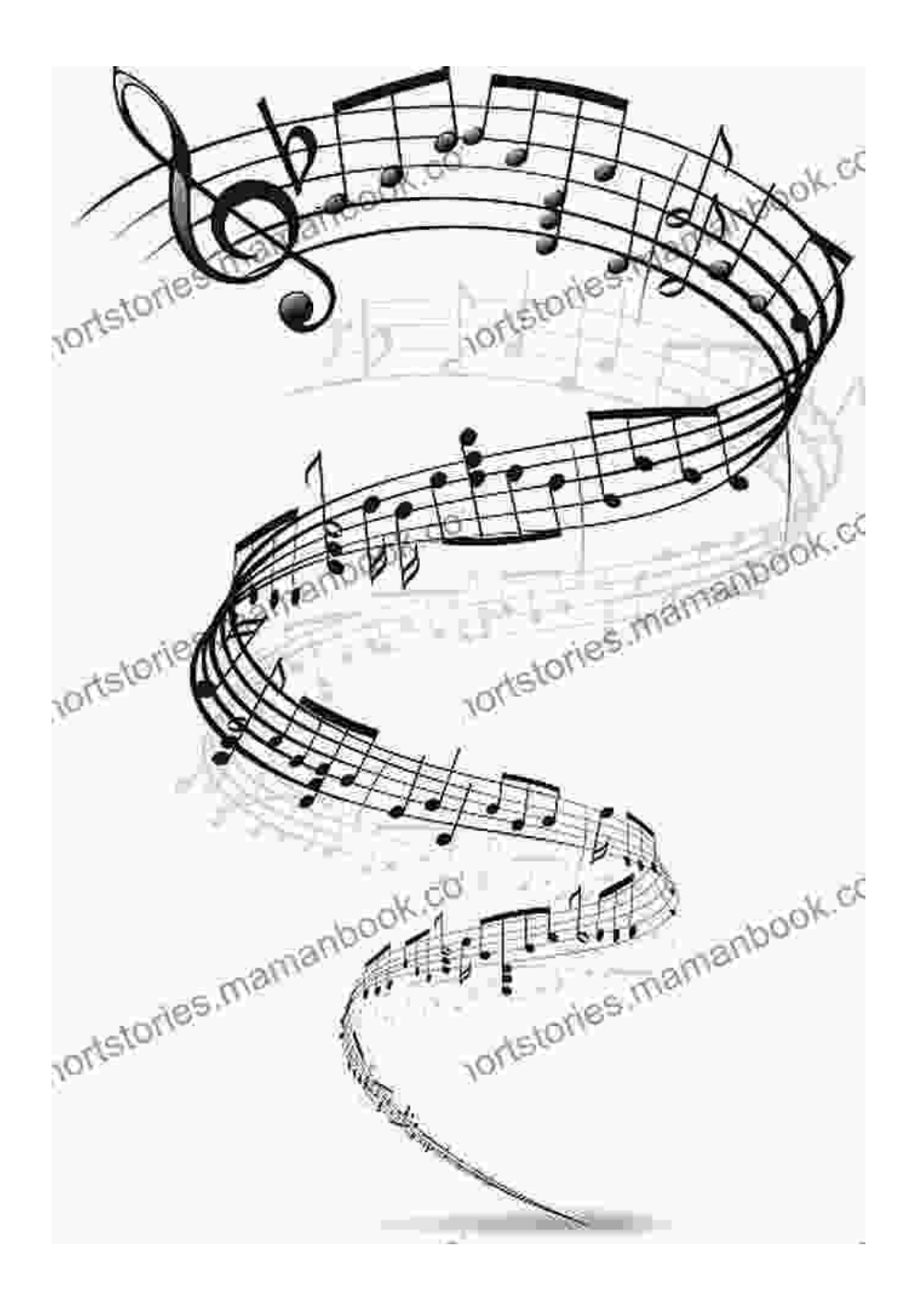
The Second Movement: A Respite in Serenity

orchestra responds with a forceful accompaniment, creating a sense of drama and tension. Mozart masterfully weaves light and darkness, juxtaposing delicate passages with thunderous chords. The movement unfolds like a tempestuous storm, filled with moments of both turmoil and exquisite beauty.